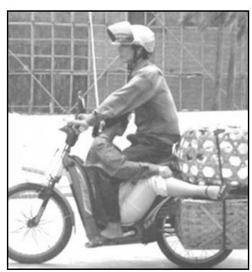
Moped Passenger Seat