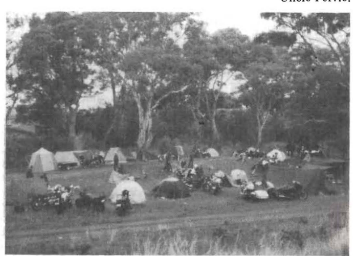
Tent City — home of the dedicated tourer!