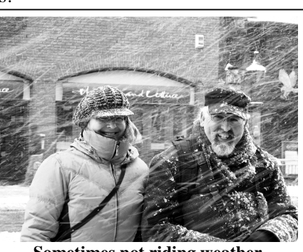
Sometimes not riding weather