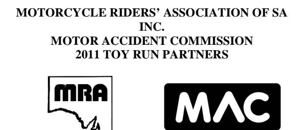
Motor Accident Commission

And thanks also for helping out: Adelaide City Council, Hutt Street Precinct Group, the Messenger Press, Couriers Please, SA Motor Sport Board, the Bremer Callington Cricket Club.