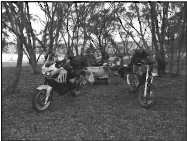
Green Triumph & Custom Built Trailer (left)