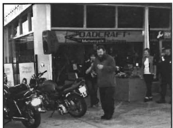
THIS GUY GOT THE PRIZE FOR THE UNTIDIEST ANSWER BOOK

http://www.mrasa.asn.au/pdf/RR070526.pdf