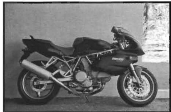
Think RED!! TIK-189

On Wednesday 13 June at 3.55 pm, a Red 1997 Ducati 750SS was stolen from outside the Bike Factory in Gouger Street, Central Adelaide. South Australian Rego number TIK-189 . The bike was in almost immaculate condition, owner's pride and joy since new. This picture is of a SIMILAR bike.