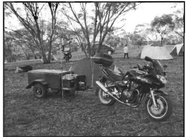
The Mighty BMW Shadow (far rear)

The next morning was as pleasant as the day before. A cup of tea, a scratch breakfast with Kiwi and we slowly started packing up. It was great, no marquee to pull down, no truck to load and no unloading back into the shed of all the MRA gear once back in Adelaide. What a difference. Just load the bike, have another cuppa and a chat, check that the fires are all out and head for home.