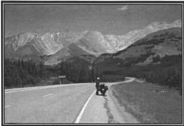
WORK - This is why you do it!

July 9 Committee Meeting July 16 Toy Run Committee Meeting July 30 General Meeting August 7 4Bs Meeting August 13 Committee Meeting August 20 Toy Run Meeting September 4 4Bs Meeting September 10 Committee Meeting September 17 Toy Run Meeting September 24 AGM