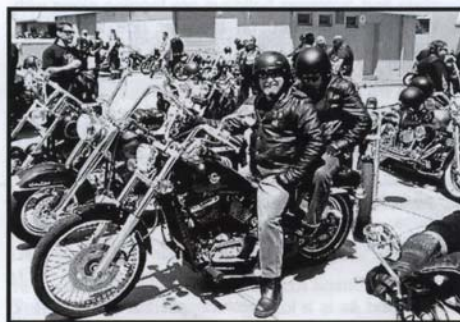
King of Clubs Poker Run November '05