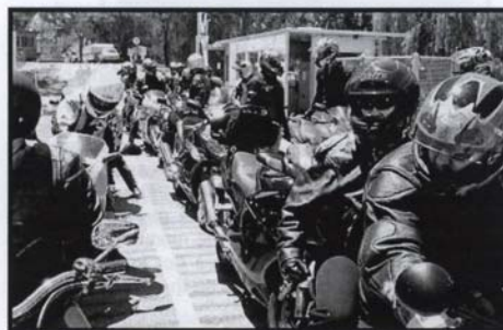
Five Ferries Run, November '05