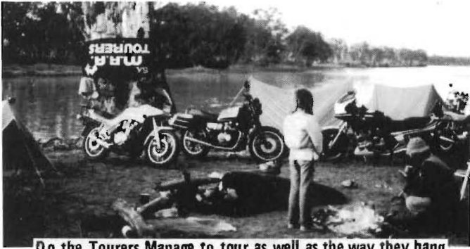
Do the Tourers Manage to tour as well as the way they hang

The joining fee is eight dollars for single membership for your first year as this includes your Tourers patch and five dollars every following year. Family membership is fifteen dollars which includes two patches and ten dollars every year you wish to remain a member. The only thing we stress is that you be a financial MRA member to be able to join the MRA TOURERS.